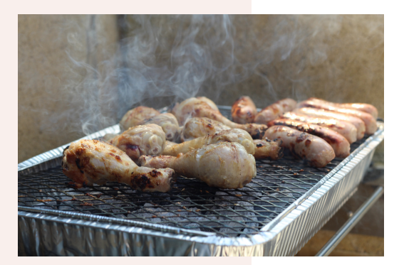
Using barbeques safely - avoid accidents