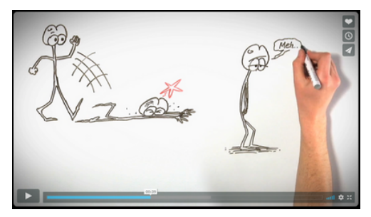
<u>What next?</u> <u>Transitioning to an</u> <u>evidence based approach.</u>